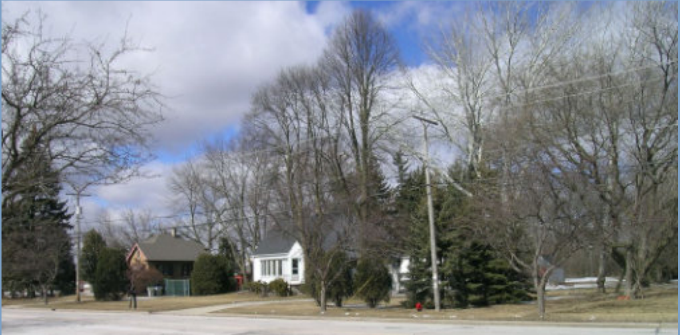
Today's neighborhood-Houses on N. 81st St. & W. Bradley Rd.