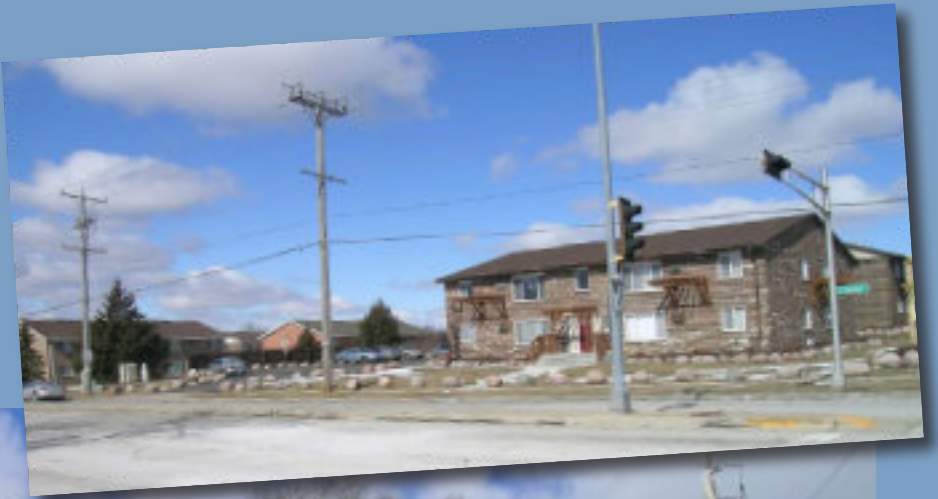
Today's neighborhood- Apartments on W. Calumet Rd.