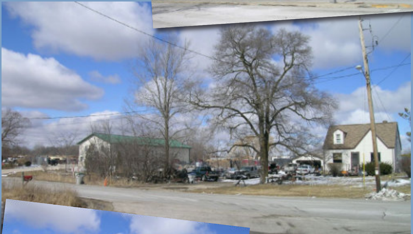
Today's neighborhood- N. 87th St. & W. Calumet Rd.