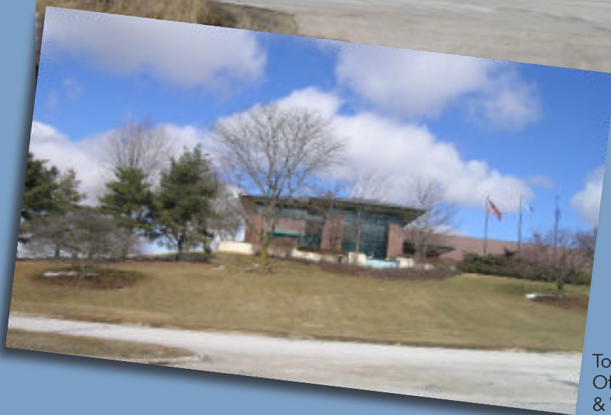
Today's neighborhood- Office building on N. 91st St. & W. Bradley Rd.